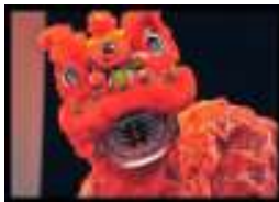
Get ready for Nut ReMix!