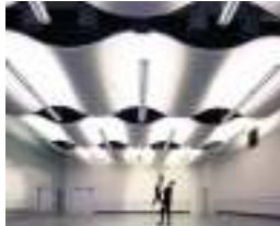
New Ballet, The Main Studio