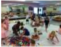
Creative Movement Summer session!