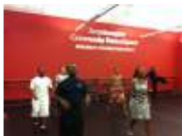
Hattiloo Theater performers in the ArtsMemphis Community