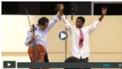
New Ballet Ensemble with Memphis Symphony Orchestra's String Theory and Yo-Yo Ma at Colonial Middle School

Click on the video thumbnail below to watch clips from the Colonial Middle School performance.