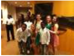
NBE students gather in Cannon Center lobby post-performance with the Memphis Symphony