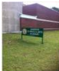
Left: New Ballet begins new partnership with Gordon Science & Arts Academy in the Crosstown neighborhood.

A new partnership with Gordon Science and Arts Academy imparts an understanding of Spanish culture through Flamenco Dance instruction while reinforcing Spanish language enrichment.