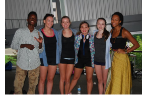
Bridges YOUnified, Aug 1 NBE students were invited to perform at the 2nd annual Bridges YOUnified, Friday August 1st. Performances by youth and for youth was a beautiful thing to see. Youth empowerment at its best!