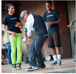
Art on the Dock, July 27 Hosted at the United Warehouse, the future home of South Main ArtSpace Lofts, Art Lounge on the Dock events celebrate the revitalization of the South Main Arts district. Teaching artists, students, and breakers performed.